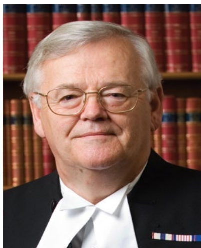
The Honourable Noël A. Kinsella 42 nd Speaker of the Senate