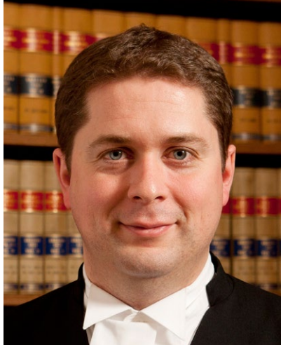
The Honourable Andrew Scheer, MP Speaker of the House of Commons

We are honored and grateful for the opportunity to walk the halls of Parliament.