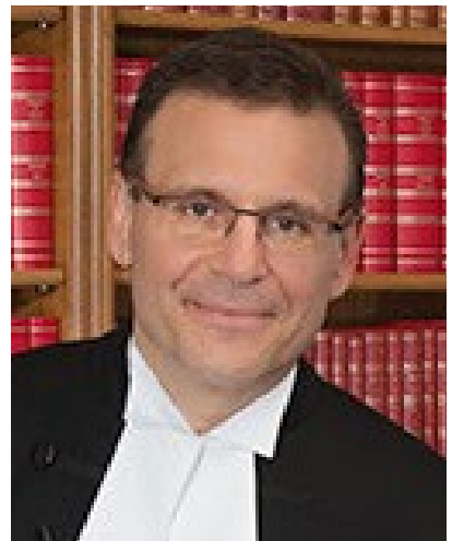
The Honourable Leo Housakos, 44 th Speaker of the Senate