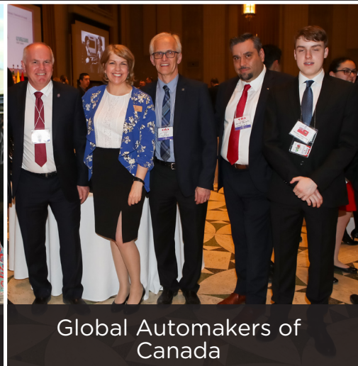
Global Automakers of Canada

THANK YOU for inspiring and empowering Canada's young leaders!