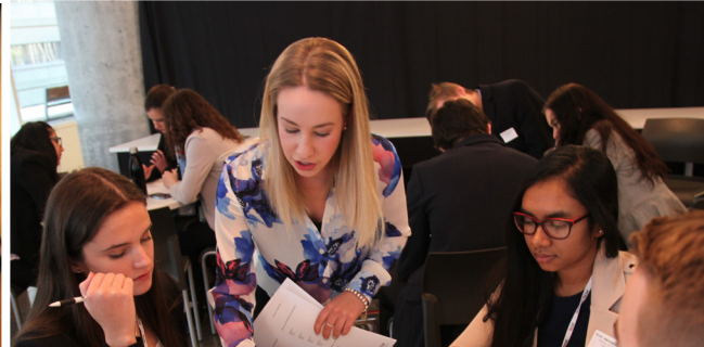
Export Development Canada