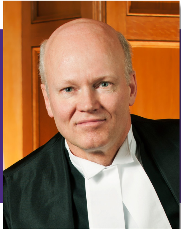
The Honourable Geoff Regan, P.C., M.P. Speaker of the House of Commons

We are privileged to have the support of the Senate of Canada and the House of Commons, and are honoured to sit in each Chamber and walk the halls of Parliament.