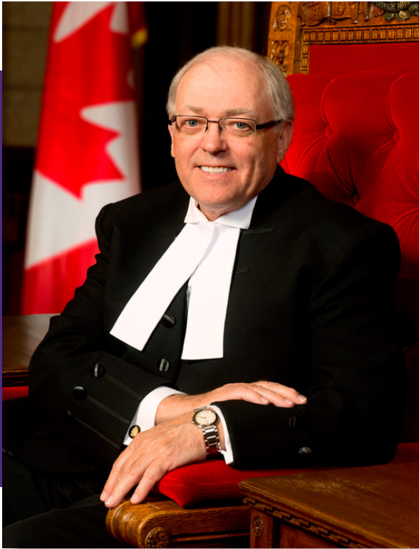
The Honourable George J. Furey, Q. C. Speaker of the Senate