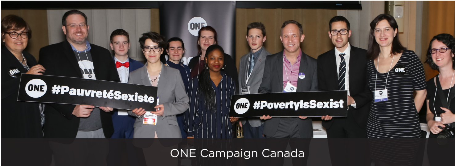
ONE Campaign Canada