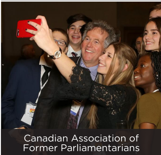
Canadian Association of Former Parliamentarians