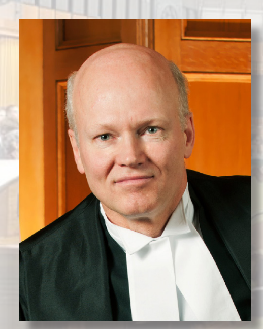
The Honourable Geoff Regan, P.C., M.P. Speaker of the House of Commons

We thank both of the Speakers for granting us the opportunity to visit the new Senate and the new House of Commons while Centre Block undergoes renovations.