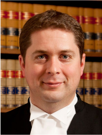
The Honourable Andrew Scheer, MP Speaker of the House of Commons

We are honoured and grateful for the opportunity to walk the walls of the Parliament building as so many have before.